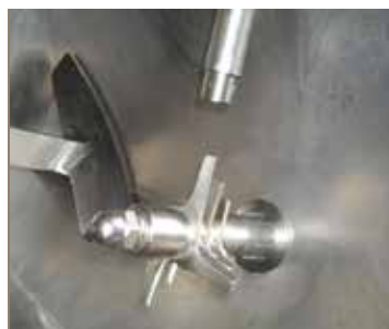
Injection of oil, fat or molasses