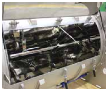
304L / 316L stainless steel internally polished