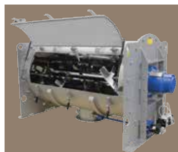
Large inspection door and easy to clean interior