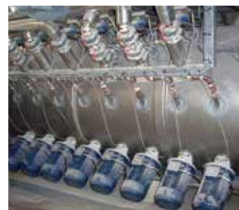
Choppers, liquid injectors and temperature jacket